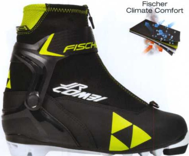
Fischer Climate Comfort