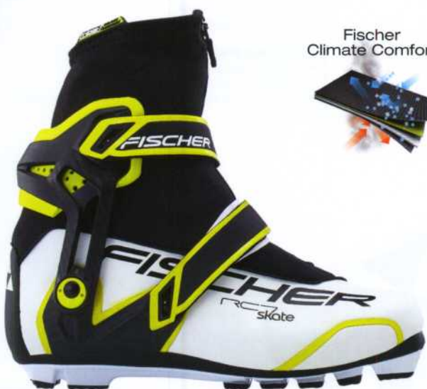
Fischer Climate Comfort