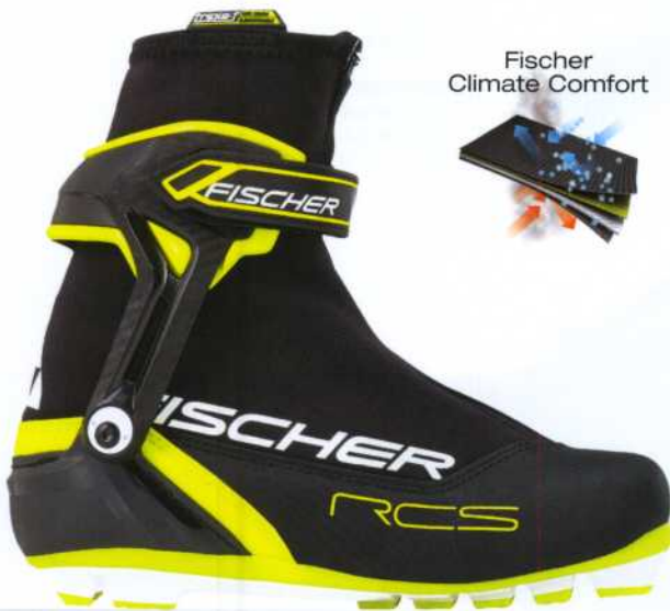
Fischer Climate Comfort