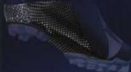
INTEGRAL CARBON CHASSIS