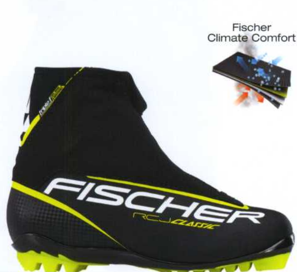
Fischer Climate Comfort