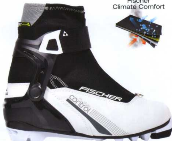
Fischer Climate Comfort